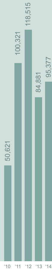
Shareholders' Funds (RM'000)